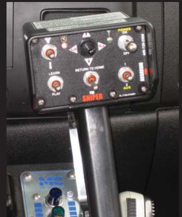
"Sniper" Monitor Remote Control

Call today for additional options and pricing!