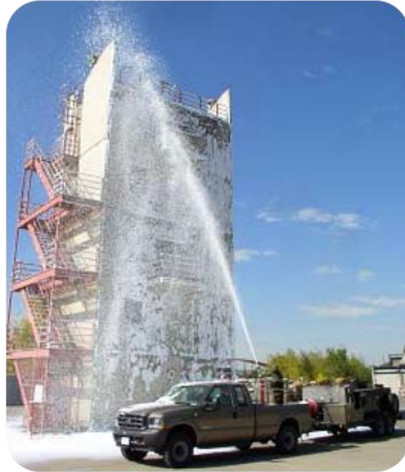
Figure 1. Large-scale foam deployment from Intelagard Falcon™ Fixed Site Decon System.

This diversity satisfies a wide range of operational objectives. For foams, depending on the volume of use, Sandia Decon Formulation has been successfully deployed by means of small handheld devices, similar to extinguishers, and in large-scale foam-generating devices (Figure 1). The formulation as liquid spray can be disseminated by means of commercially available paint sprayers. Commercially available cold foggers work well when deploying the formulation as a fog.